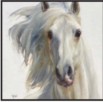
Cover Artwork: "White Lightening" (20 x 16 in; oil on linen)